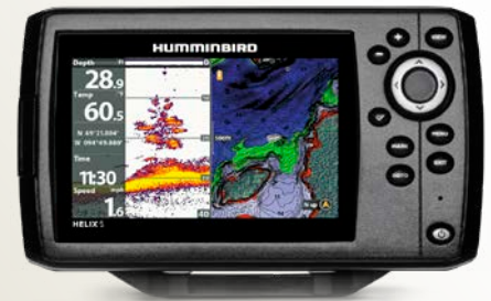
HELIX 5 CHIRP GPS G2 WITH PURCHASE OF A NEW TOPWATER PDL